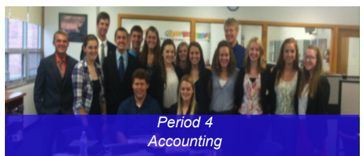
Period 4 Accounting