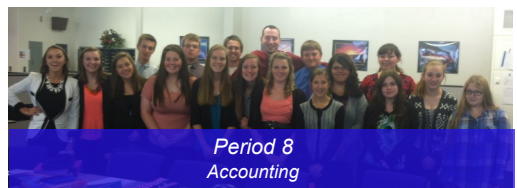
Period 8 Accounting