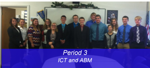
Period 3 ICT and ABM